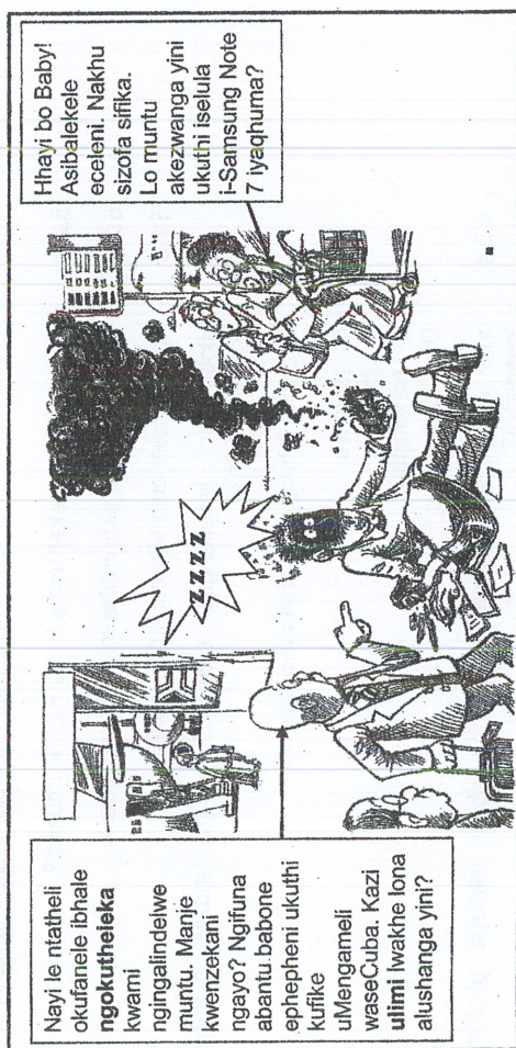
[Izithombe sicashunwe ku-goodlepics]