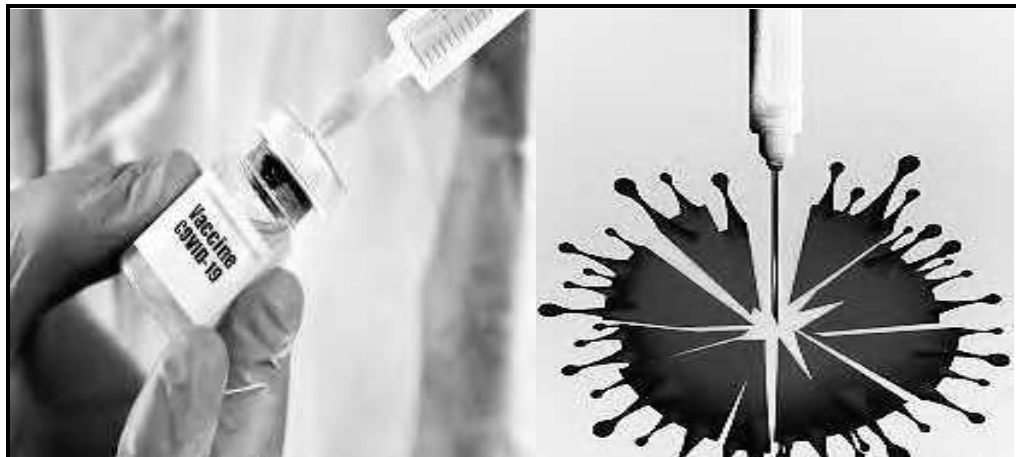
[Sicashunwe ku- wwwgoogle.com ]