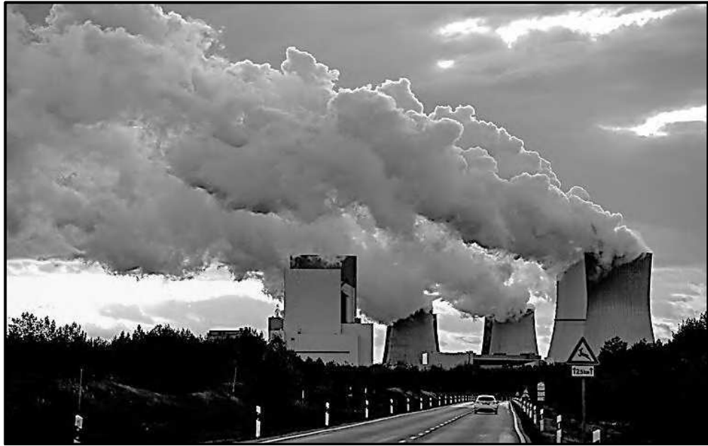
[Sicashunwe ku- wwwgoogle.com ]