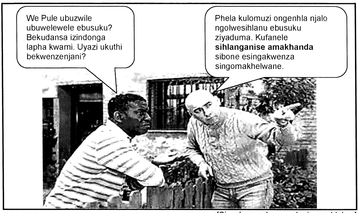
[Sicashunwe ku-googlepics, sahlelwa]

5.2.1 Lungisa amaphutha emshweni olandelayo: