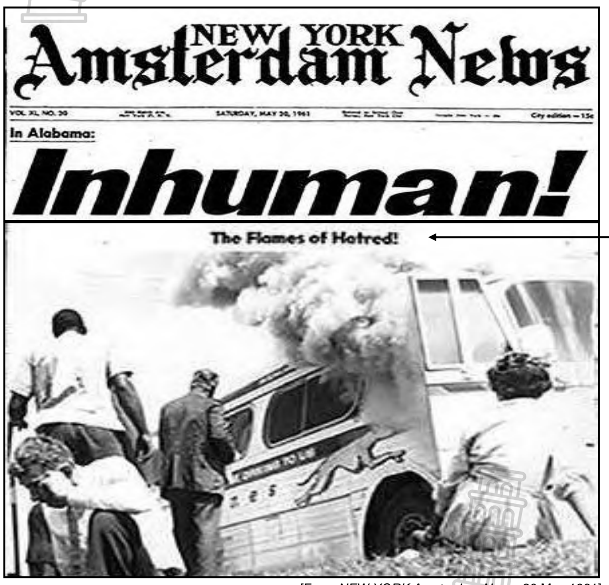
[From NEW YORK Amsterdam News, 20 May 1961]

The newspaper article below was published in the NEW YORK Amsterdam News on 20 May 1961. It used a photograph to effectively report on the challenges that Freedom Riders encountered in their demonstration against racial segregation in the United States of America.