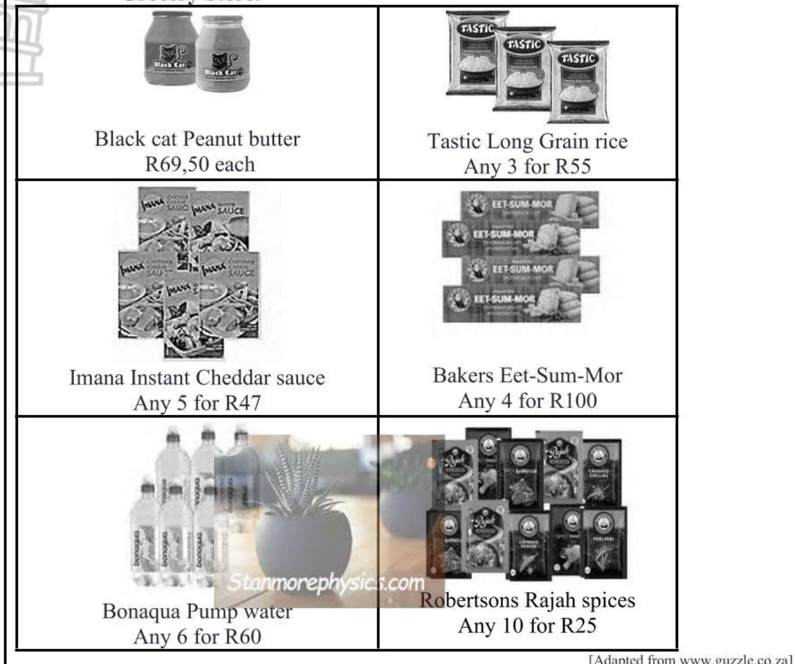
TABLE 1: Catalogue showing prices of bulk items on specials at Mega Grocery Store.

1.1 Mokete received a catalogue from Mega Grocery Store specials for 6-12 April 2023.