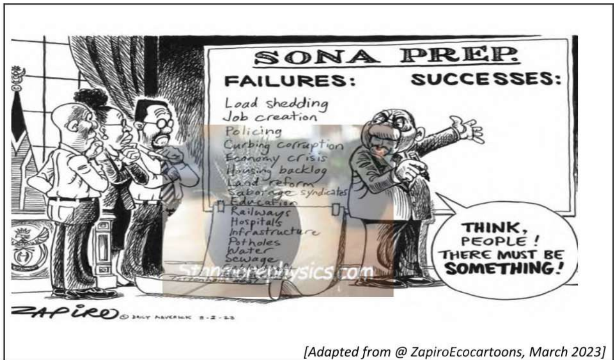
[Adapted from @ ZapiroEcocartoons, March 2023]

2.2 Study the cartoon below and answer the questions that follow