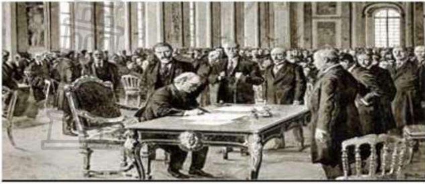
Signing the treaty of Versailles 1919

2.1. SOURCE A is a speech given by who in 1918? (1)