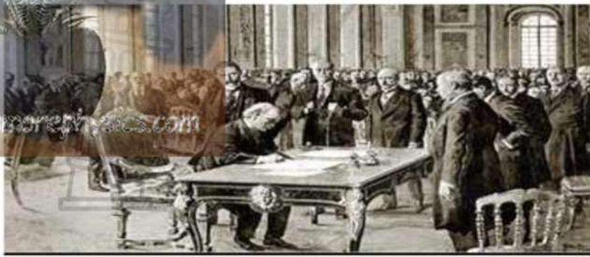
Signing the treaty of Versailles 1919

2.1. SOURCE A is a speech given by who in 1918? (1)