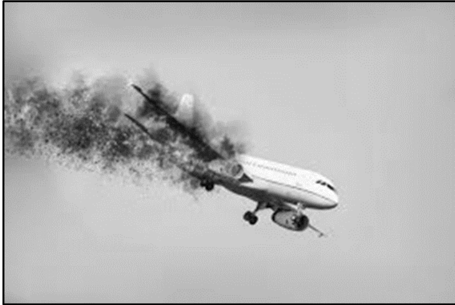
[Sicashunwe ku- www.google.com ]