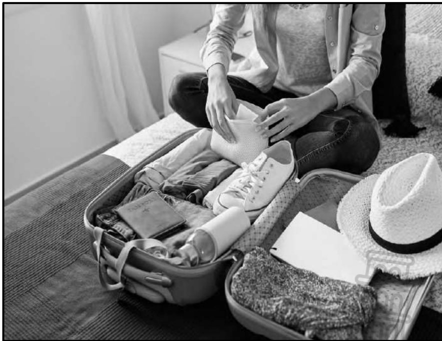
[Sicashunwe ku- www.google.com ]