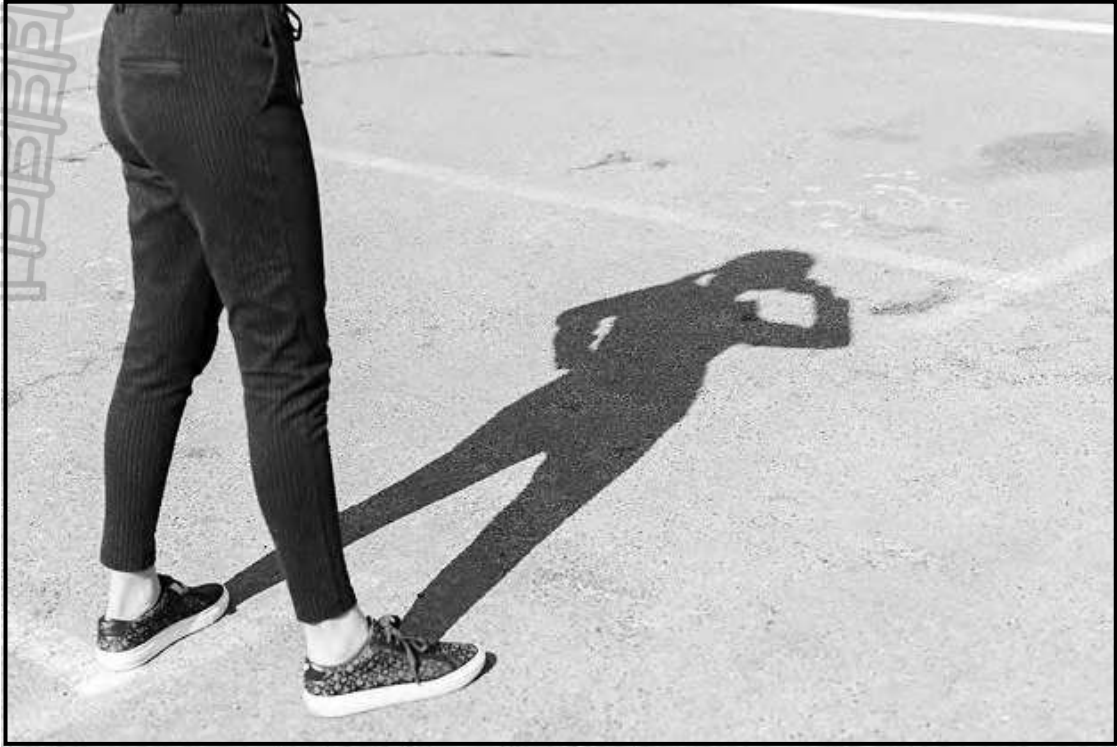
[Sicashunwe ku- www.googlepictures.com ]